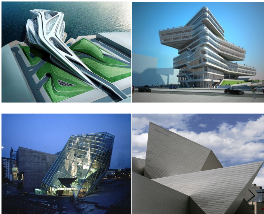
Figure 1: Top left and top right: Performing Arts Centre, Abu Dhabi, and Spiral Tower, Barcelona, of Zaha Hadid 1 ; Bottom left: UFA Cinema Centre, Dresden, of CoopHimmelb(L)au 2 ; Bottom right: Denver Art Museum of Daniel Libeskind 3

Let us consider a system describing a physical process. It is normal to expect that when using different starting values the system would produce different results, but somewhat similar qualitatively and quantitatively. However, if the system is non-linear, small perturbations in the initial data can lead to large variations in the final results. This unpredictable behaviour and sensitive dependence on the initial conditions is called chaos. For example, the motion of the planet Mercury is described by a non-linear unstable system which implies that a small error in its initial position will be amplified such that there is a limit to how far into the future we can predict its position. Mathematical chaos arises in huge complex systems, such as weather forecasts or turbulent flow, but also in very simple systems as those described by the logistic equation. The previous systems are deterministic and their future could be completely determined by the initial data. However they are not predictable, because non-linearity leads to explosive amplifications of initial perturbations.