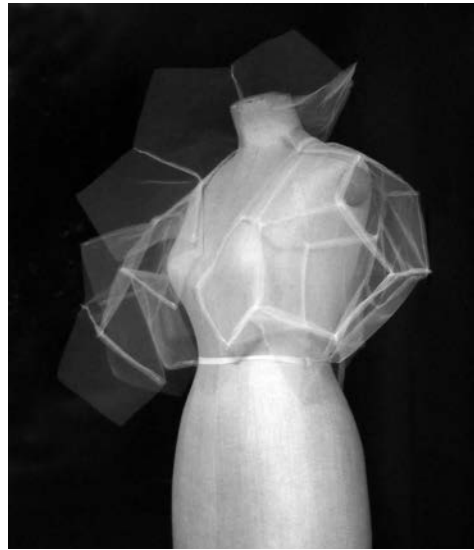
Figure 2: Bolero made out of three deconstructed dodekahedra by Walter Lunzer.