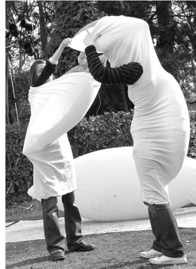
Figure 4: Prototype for an inflatable fashion object by P. Michael Schultes. Fotocredits: Air-shaped cloud group ©dieAngewandte