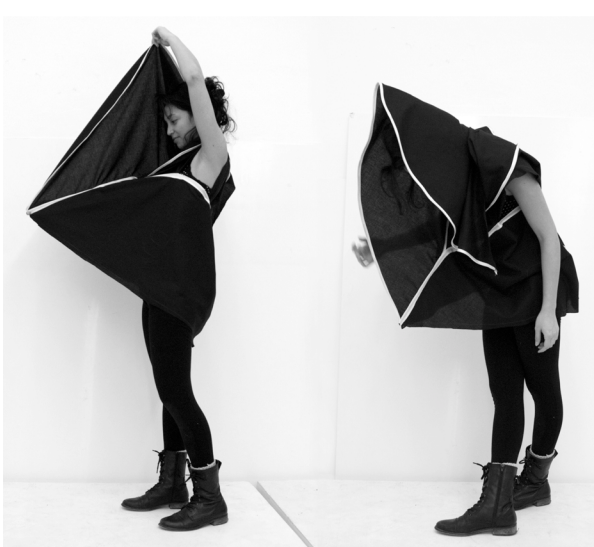
Figure 3: Prototype for a Body-Index-Cloth by Jasmin Schaitl.