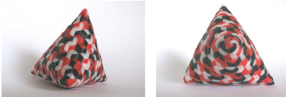
Figure 6: A skew mad weave tetrahedron with six strands in three colours.

Obviously there is a whole series of tetrahedra with an increasing number of elements = 3n , and if n is divisible by 3 they can be made starting with an open weave framework. Colour schemes will have tetrahedral symmetry (in the same way as the n = 1 case) only if the pairs of elements symmetrical about an edge have the same colour (applying the same arguments as in the n = 2 case).