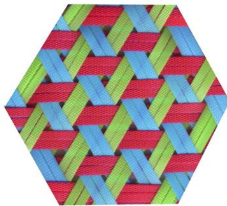
Figure 1: A sample of mad weave.

Mad weave is a basketry technique with weaving elements in three directions (at 60^\circ to each other) woven close together so that an almost continuous surface is produced. Technically it is a twill weave since for any pair of directions the weaving elements in one direction go under 1 over 2 (those in the other direction go over 1 under 2). The weaving pattern is cyclically related: A goes under 1 over 2 Bs (so B goes over 1 under 2 As), B goes under 1 over 2 Cs, C goes under 1 over 2 As (figure 1). The resulting structure has p6 ( 632 ) symmetry, with small holes occurring at the centres of sixfold and threefold symmetry. It is important to remember the distinction between the two types of hole and the chirality of the weave when trying to understand how it works, especially when trying to create it practically.