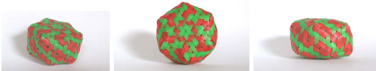
Figure 4: Three views of a mad weave hexagonal antiprism.

All of the Platonic polyhedra produced in this way have diametral loops (the tetrahedron has three loops in planes mutually at right angles and the octahedron four) with smaller loops in parallel planes, so that many small lengths are used in the construction. The hexagonal antiprism is rather more interesting, and the simplest open hexagonal construction needs only two strands, so that six are needed to make the mad weave equivalent (figure 4). The open hexagonal framework has strands of opposite colour, and the mad weave is completed by adding in pairs of strands that are opposite in colour to the parallel strand in the base framework. The chiral appearance of the finished polyhedron results from the chirality of the structure.