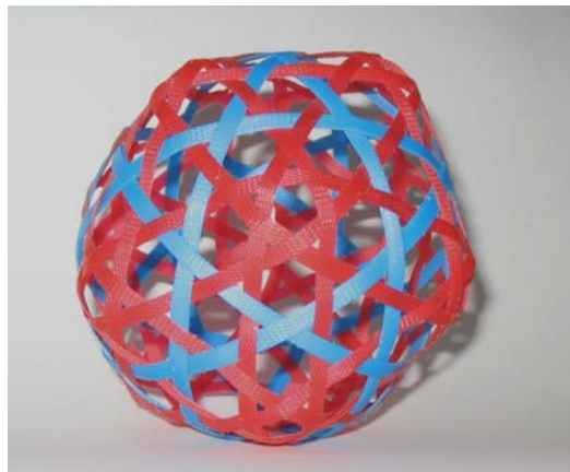
Figure 3: An open hexagonal plaited icosahedron.

Figure 3 shows an open hexagonal icosahedron, which can be seen as the traditional six loop icosidodecahedron with some added elements, although there would be problems constructing it in this way because of the difficulty in keeping the lengths right. The existing structure keeps everything in place if it is built using open hexagonal plaiting.