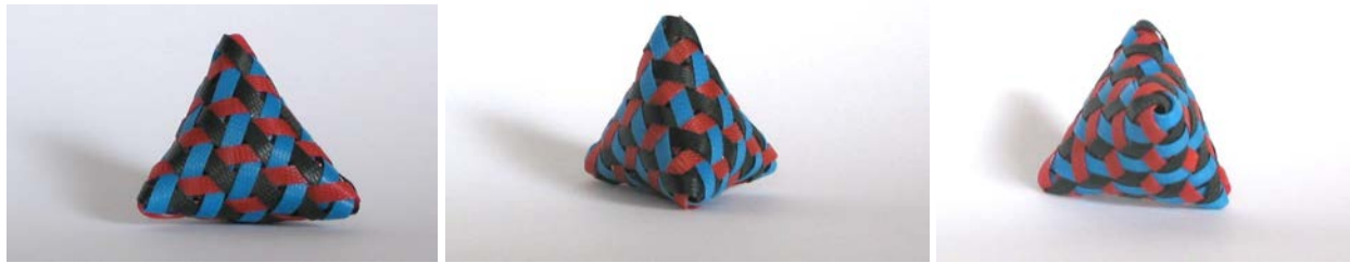
Figure 5: Three views of a three strand mad weave tetrahedron.

This means that if a tetrahedron is woven on the skew no weaving element changes its direction as it covers the surface, so it is possible to produce a mad weave tetrahedron with exactly three strands (figure 5).