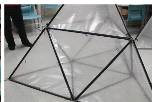
Figure 8: Hidden Shapes