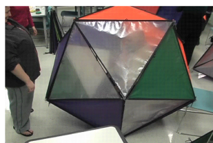
Figure 7: Sitting Inside