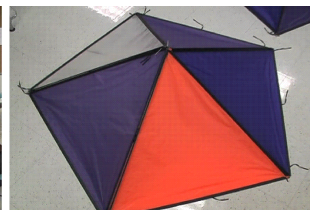
Figure 3: Angle Sum 3