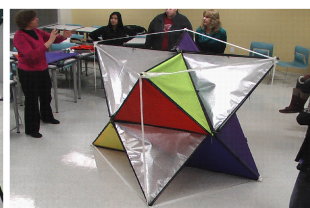
Figure 9: Cube surprise