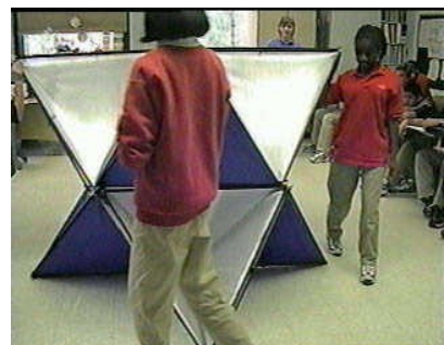
Figure 10: Turn and stop game

This provides an opportunity to demonstrate rotational symmetry about the observed vertical axes going through vertices, edge midpoints, centers of faces, and the centers of the whole shapes. The turn and stop game (figure 10) is an interactive way to investigate the rotational symmetries of polyhedra. The polyhedron is rotated from an initial position, by students walking around with