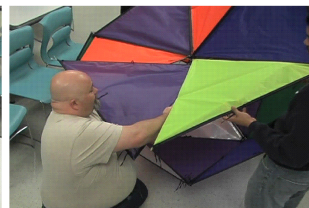
Figure 5: Trial and Error 2