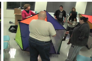
Figure 6: Counting Faces