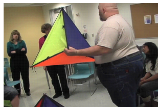
Figure 2: Angle Sum 2