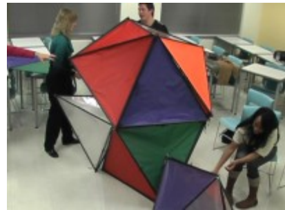
Figure 11: Curiosity-driven discovery; ‘we wanted to see how the shapes fit together’

The participants’ personal investment in solving construction problems in the less traditional classroom setting gives them a stake in deciding what to do next such as in the open-ended artistic and mathematical curiosity-driven discovery activity (figure 11). The availability of a physical manipulative model in space which is readily constructed into a wide variety of shapes facilitates exploration of a wider range of shapes. A description is given in [1] of activities in an elementary school which successfully combined the play aspect of the giant triangles with the mathematical concept explorations that the instructors overlaid.