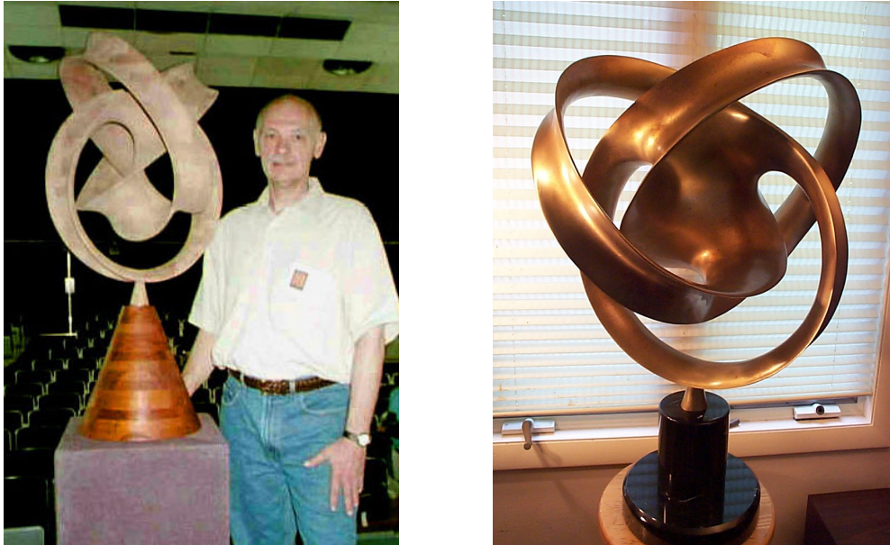
Figure 2: Left: at Bridges 1999, Brent Collins presented the wooden master of Atomic Flower II . Right: my bronze cast of Atomic Flower II .

The next summer I met Collins again at Bridges 2000, where he presented new work like Music of the Spheres [3]. On the way home I also got to see his large exhibit at the Albrecht–Kemper Museum in St. Joseph, Missouri, which included Atomic Flower II . That same year, I bought a bronze cast (Figure 2, right) of Atomic Flower II . (As with Collins’ other bronzes, the cast is by Steve Reinmuth.)