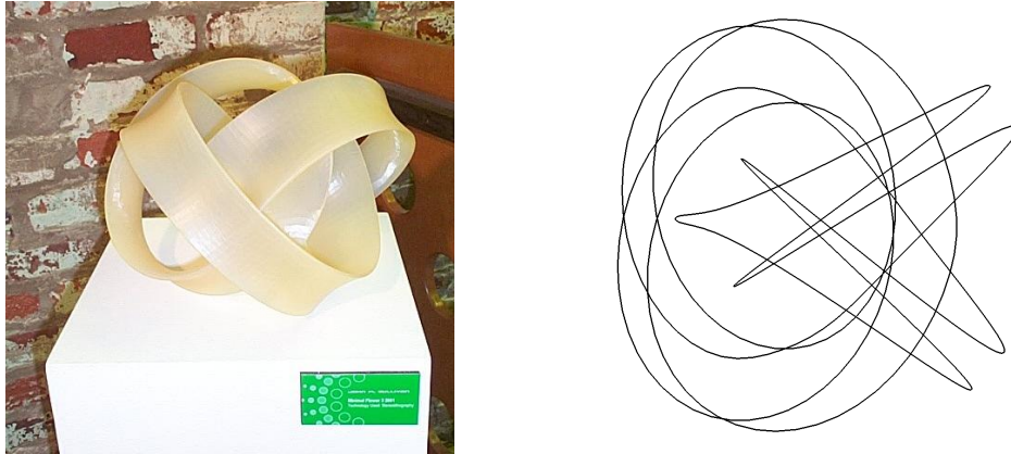
Figure 4: Left: a 30 cm stereolithograph of Minimal Flower 3 on exhibit in Dayton in 2001. Right: the boundary curve for Minimal Flower 4 projected orthogonal to the axes of two of the helical pieces.

Finally, I had an object I was happy with: this result became Minimal Flower 3 , my first sculptural work – and an homage to Brent Collins, whose work had been so inspirational to me. It was first exhibited (in a stereolithography print at the 30 cm scale) at the Dayton, Ohio site of Intersculpt 2001. (See Figure 4, left. A smaller FDM model is shown in Figure 1, left.) A description of Minimal Flower 3 much briefer than this was included in my 2003 essay “Optimal Geometry as Art” [5].