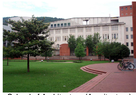
School of Architecture (Arquitectura)

There is no entrance to the School of Architecture though that square. To enter the building go to the right part of the square and search for the red brick building with four doors. Enter the building and you will find the Bridges reception desk at the end of the main passage of the School. The art gallery is placed behind the first door of the left.