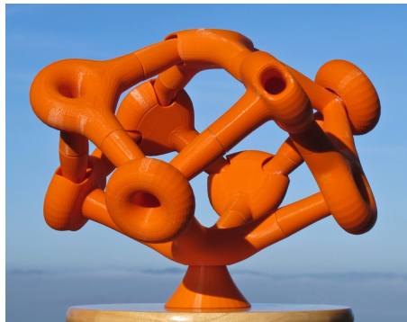
Figure 1: An individual figure [6]. Make it large enough so that necessary details can be seen. Fine-tune its size, so that you obtain convenient page breaks.

If you are writing your paper using MS-Word or a compatible word-processor such as OpenOffice [4], please use a copy of this document as your starting point. This template has been set with the proper paper size and all the necessary styles for proper formatting. Just replace segments in this text with your own text; introduce it as pure text and, if necessary, select the appropriate style from the style menu. Also substitute your own image for the figures in this template, either as an individual figure like Figure 1, or, alternatively, as in the composite Figure 2. By default, figures are placed in-line with text, starting on a new line, and separated horizontally by a few blank spaces. The line that contains the figure(s) should have its style set to be Figure Display . Each figure is then followed by a paragraph with style Figure Caption .