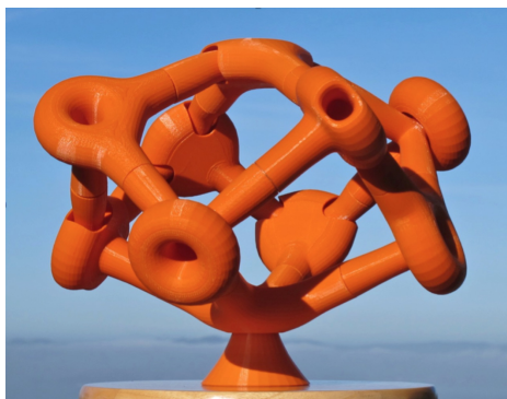
Figure 1: An individual figure [6]. Make it large enough so that necessary details can be seen. Fine-tune its size, so that you obtain convenient page breaks.

If you are writing your paper using \text{\LaTeX} , please use a copy of the source .tex file for this document as your starting point. Some useful \text{\LaTeX} resources are [1, 5]. This template (with its accompanying style file) has been set with the proper paper size and all the necessary styles for proper formatting. Just replace the text in this file with your own text. Also substitute your own images for the figures in this template, either as an individual figure like Figure 1, or, alternatively, as in the composite Figure 2. Each figure is then followed by a \caption .