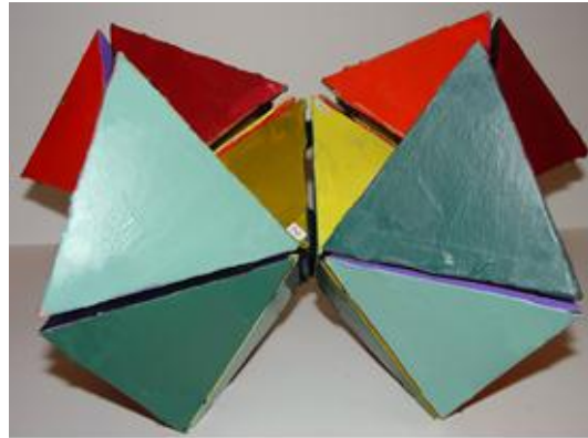
Figure 3 – Preliminary polyhedral representation of \mathbf{Z}_2^3

The model that we have constructed is the set of all three dimensional regions of the elementary abelian group of order 8, \mathbf{Z}_2^3 . Using Magma, we can write the four inversions as permutations of 16 objects. These objects are the tetrahedra. The tetrahedra come in two varieties. One variety will be the original and have the same function as the yellow regions in Figure 1 and the other variety will represent the orientation-reversed cells, similar to the purple regions in Figure 1. The two varieties will have similar colors with the orientation-reversed cells a somewhat darker color. The solid that results from putting these tetrahedra together will have a boundary and each boundary cell will be connected to other cells on the boundary. We can see two configurations for this model in Figures 2 and 3. When this region is “folded”, it results in a three dimensional manifold which can only be embedded in a higher dimensional space.